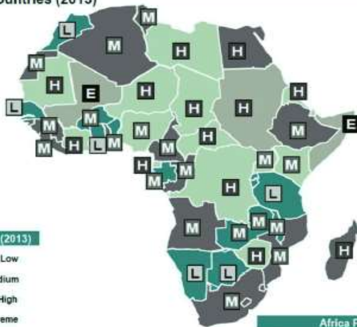
Risk Profile of African Countries (2013)